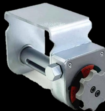
28120055 C-Channel Slider