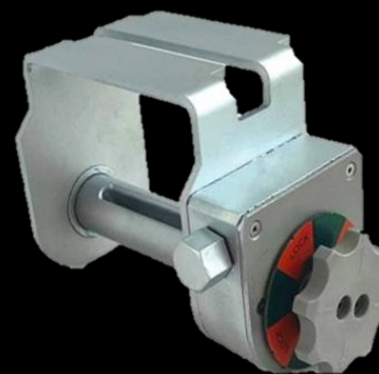
28120054 Double L Slider